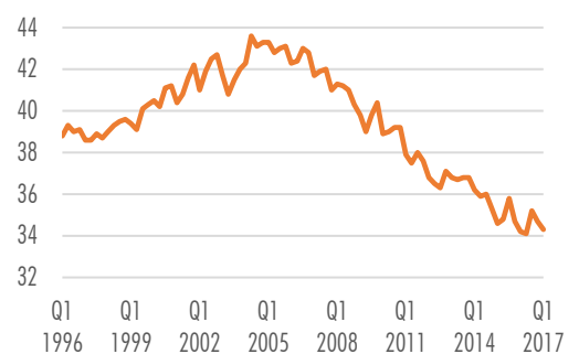
Figure 3: Homeownership Rates for Adults Under 35